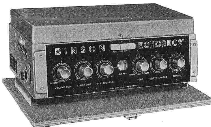
mod. Echorec 2° - With Echo-Swell-Repetition-Reverberation - 3 channels with push button selection.